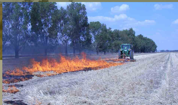
Back burning the perimeter of the field minimises the risk of fire escape

Light blue colours show the right wind speed for burning. Look at wind direction to avoid affecting towns and roads.